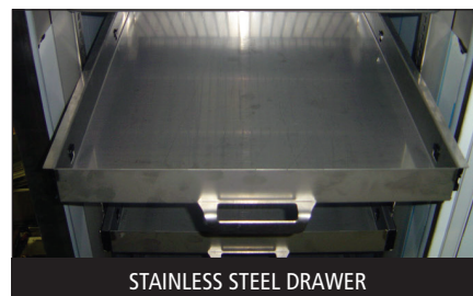
STAINLESS STEEL DRAWER