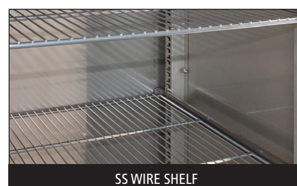
SS WIRE SHELF