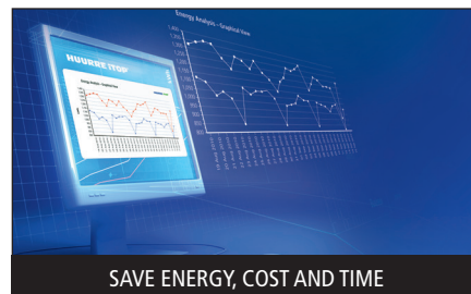
SAVE ENERGY, COST AND TIME