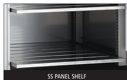
SS PANEL SHELF