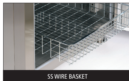
SS WIRE BASKET