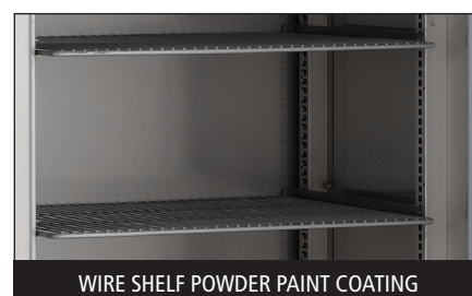
WIRE SHELF POWDER PAINT COATING